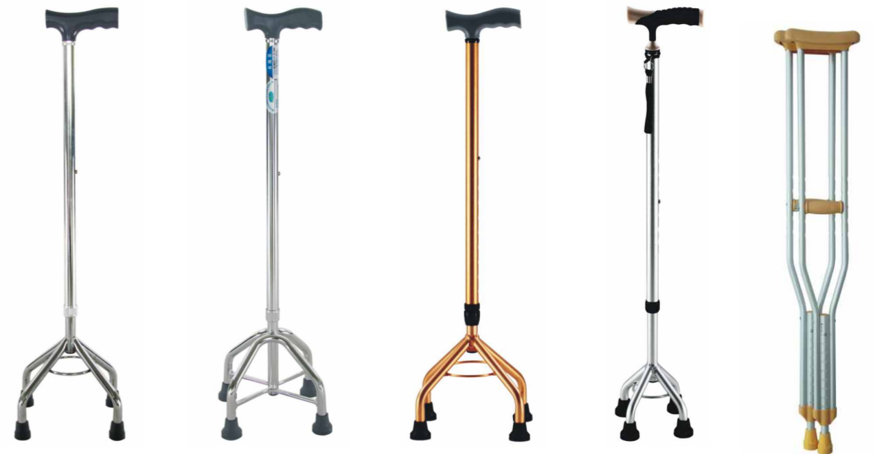
RJ-A948 | RJ-A948L | RJ-A948L-V | RJ-A948L-S | RJ-A925L(S.M.L)