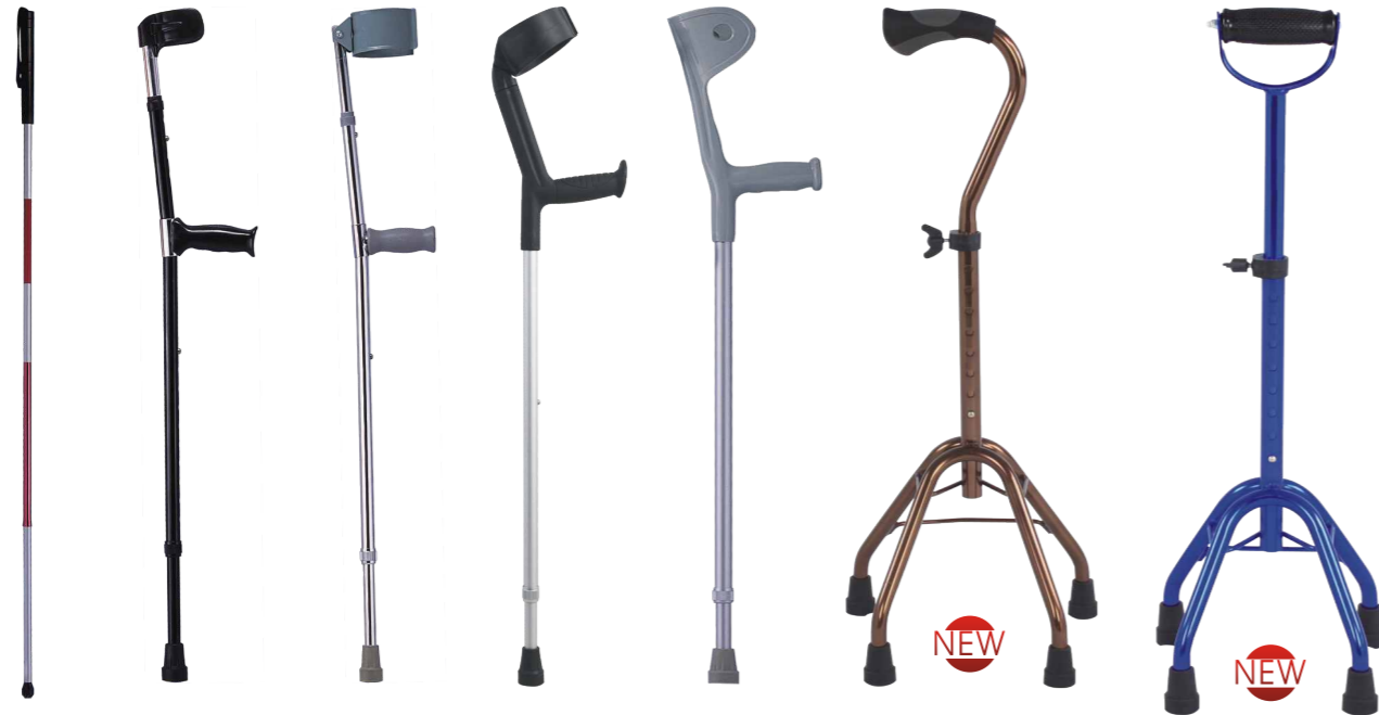
RJ-Z936L | RJ-Z923L | RJ-Z933L | RJ-Z9332L | RJ-Z937L | RJ-Z924L | RJ-Z42L-A