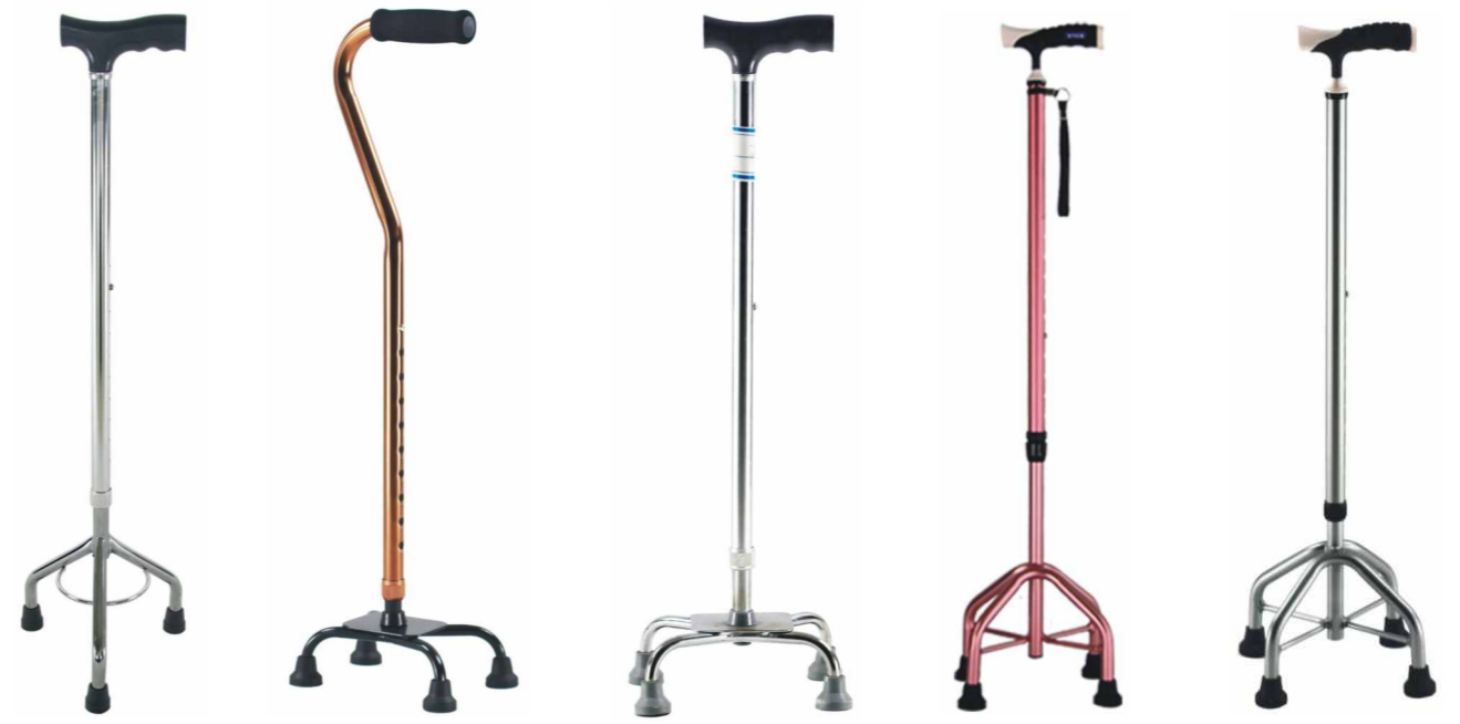
RJ-A936 | RJ-A941 | RJ-A944 | RJ-A946L | RJ-A946L-M