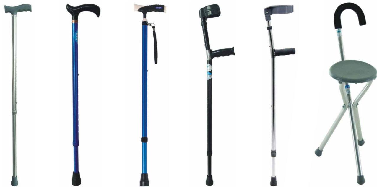
RJ-A905L-4 | RJ-A905BL | RJ-A905L | RJ-A928L | RJ-A929L | RJ-A931L